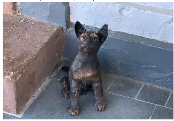
Foodworks Pup: Scoop