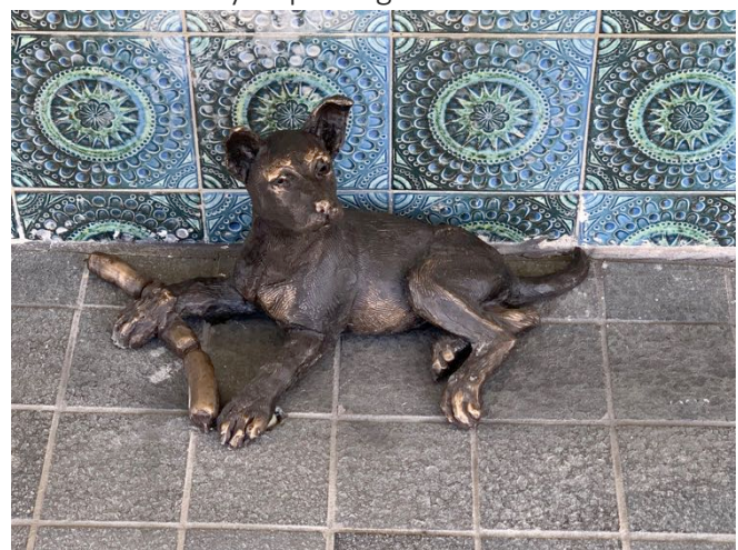
Keep an eye out for these gorgeous little mates as you make your way up Sheridan Street.

Another very worthwhile spot to visit if you haven't been before in the Australian Pen Museum.