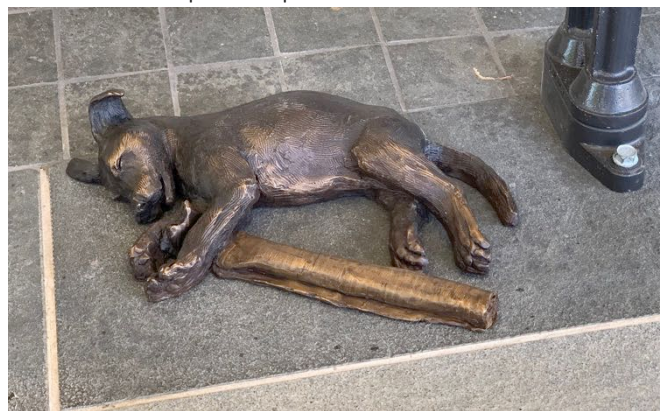
Smarts Butchery Pup: Snags